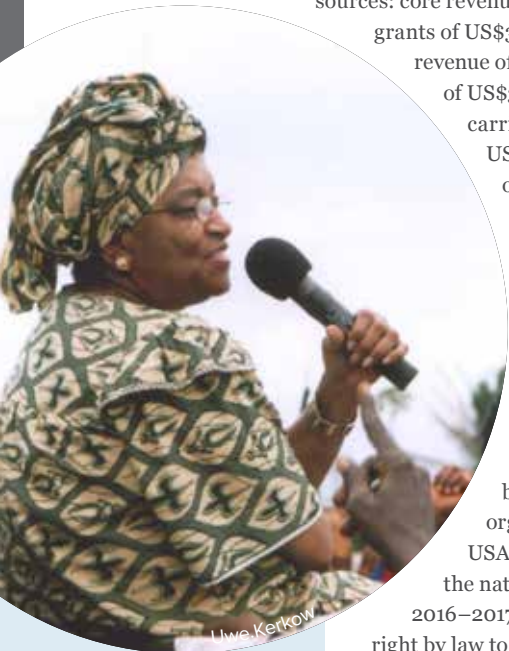
Liberian President Ellen Johnson Sirleaf