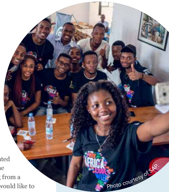
Students in Mozambique pose for a group selfie at an Africa Code Week event.

For more information, visit http://africacodeweek.org .